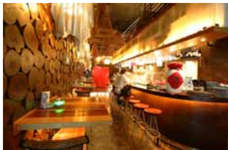
G/F & 1/F, Knutsford 6, Knutsford Terrace

香辣屋是一個享用泰式及越式佳的好去處，加上舒適的環境，絕對是一個三五知己共聚的好地方。