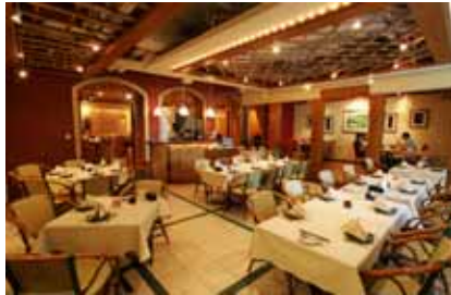
1/F, Knutsford 10, Knutsford Terrace