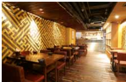
1/F Koon Fook Center, 9 Knutsford Terrace