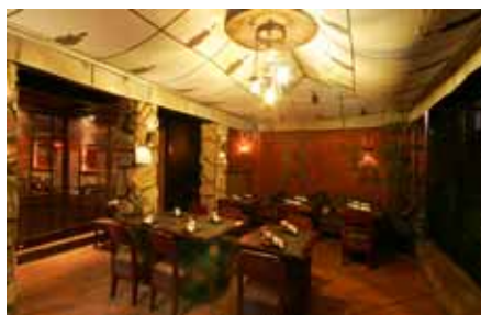
G/F, Yiu Pont House, 12 Knutsford Terrace

位於尖沙咀及銅鑼灣的 Island Seafood Restaurant 的裝飾充滿海洋氣息餐廳當然以新鮮海鮮為主打，包括蝦蟹類、貝殼類及魚類，選擇可謂五花八門。