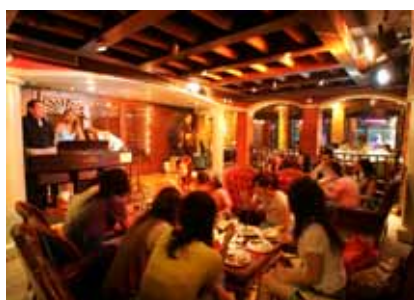
3/F, 10 Knutsford Terrace

這間已擁有三間分店的西班牙餐廳，讓你一邊細嚐傳統西班牙菜，一邊享受 live band 的即場演奏，令你充分感受到西班牙的熱情款客文化。以紅色為餐聽設計的主色，為識食的您提供一個浪漫的好去處。