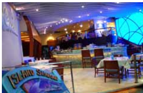
G/F, 10 Knutsford Terrace

天與地讓您品嚐各款充滿上海四川及台灣風味的中華料理，每晚更有「歡樂時光」，讓您與良朋知己暢快來一杯，更有多款佐酒美食。