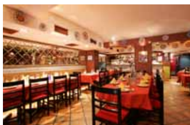
G/F, New Knutsford House, 14 Knutsford Terrace

狎鷗亭居酒屋 - 諾士佛台的最新成員，韓國新派居酒屋，舒商環境為其吸引之處，數十款韓氣佐酒小菜，多款令人愛不釋手的韓風雞尾酒，定能令你忘記煩憂，享受一個輕鬆的晚上。