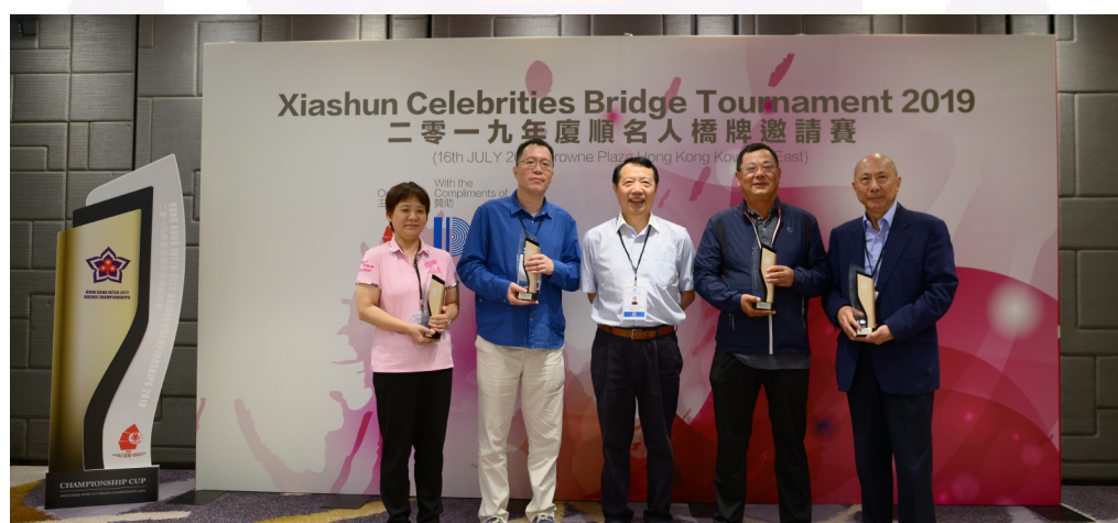
2nd Runner-up: Team 1