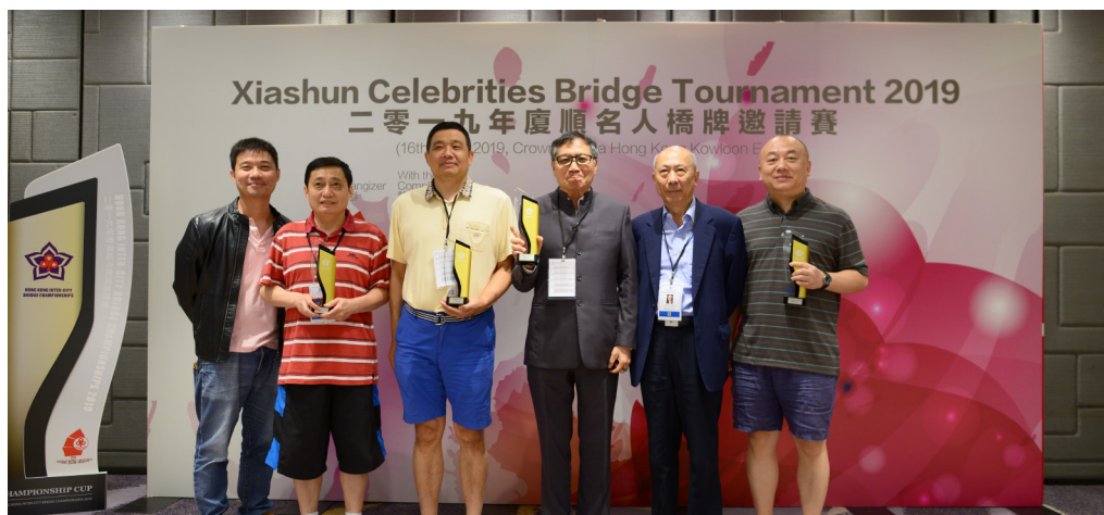
The Champion: Team 4