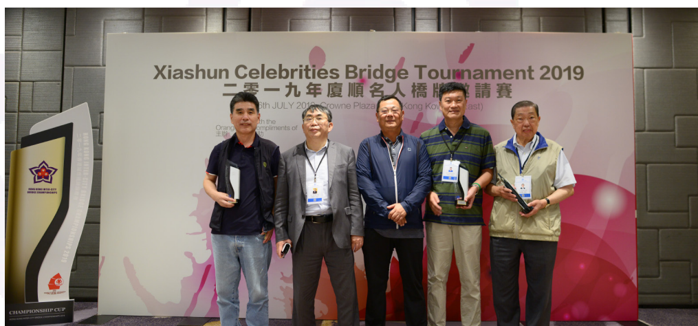
1st Runner-up: Team 6