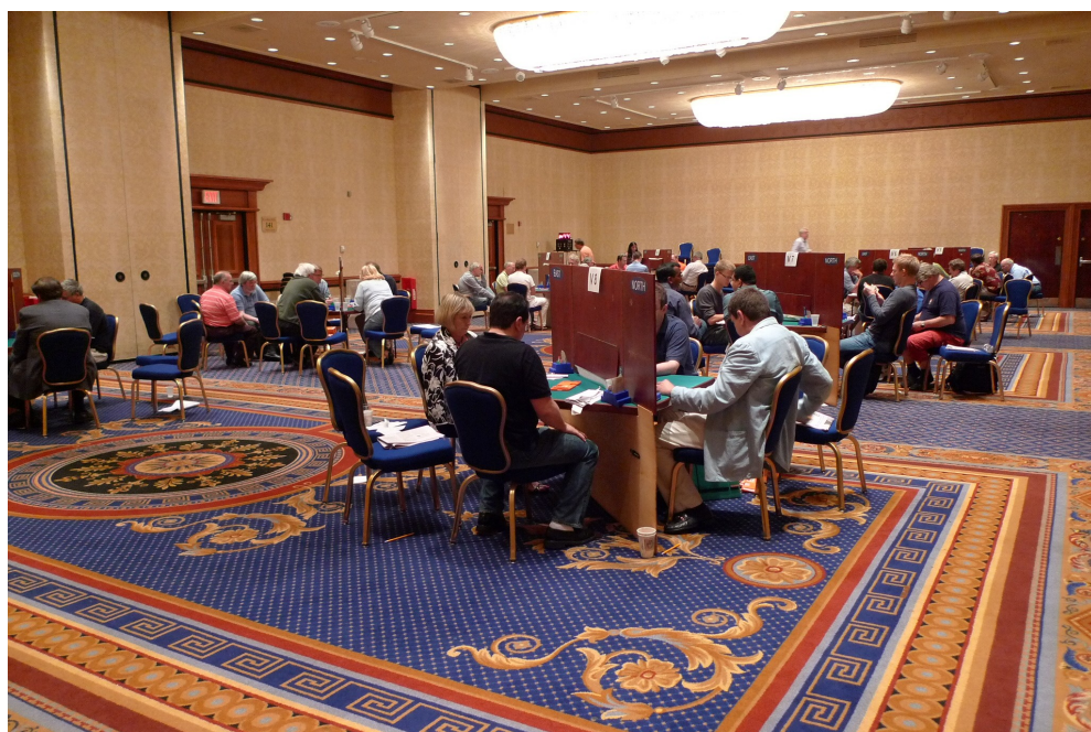
Spingold - Round of 16

1 ♦ – 1 ♥ – 3 ♥ – 4NT – 5 ♣ (1 key-card) – 7 ♥