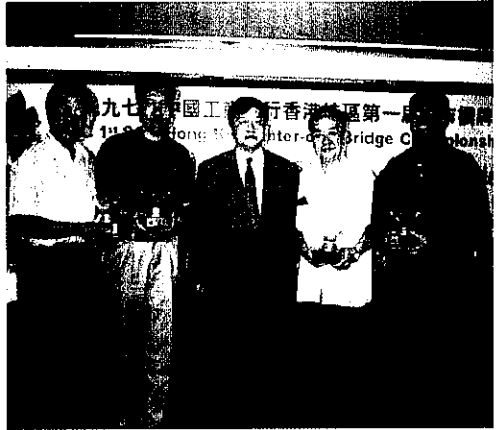
香港 Samme 隊獲 Swiss Team 亞軍