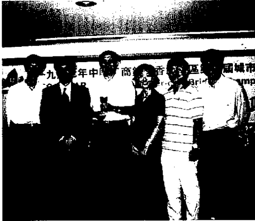
香港 Ng 隊進入公開組前四名并獲得最少IMP失分獎