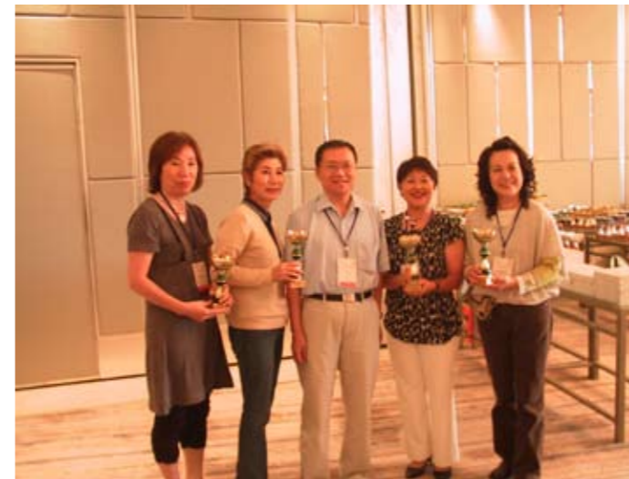
Ladies Series - 1st Runner Up (Hoot)