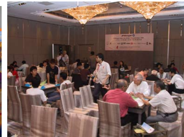
IMP paires - 40 tables