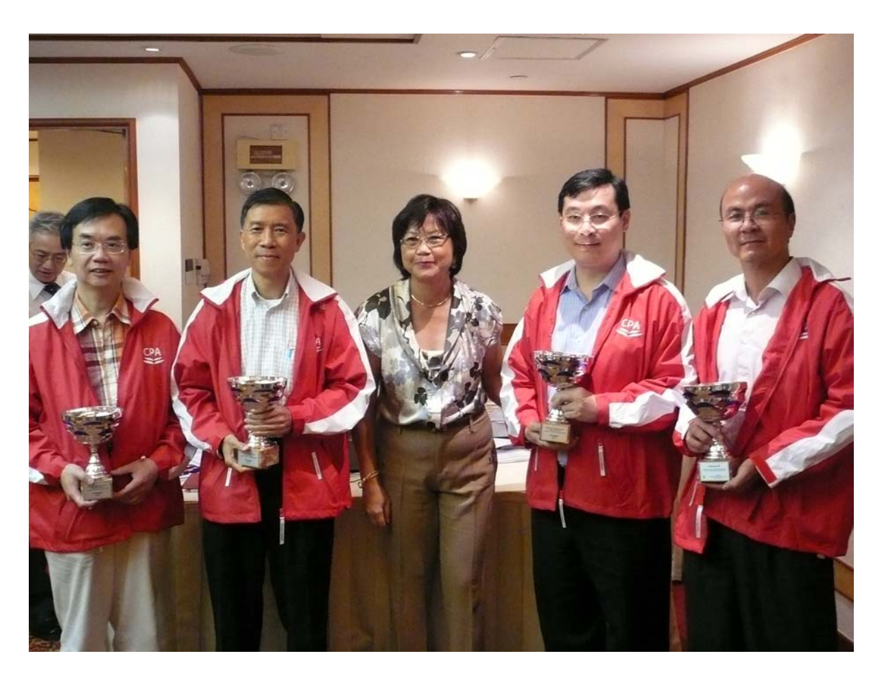
Champion: Hong Kong Institute of Certified Public Accountants Team 2

The Inter Professional Teams Bridge Tournament, hosted for the second consecutive year now, was completed yesterday at Hotel Miramar. A total of 8 teams competed in this event, as a warm up to the JPMorgan Inter-city Bridge Championships. The eventual winner was a team from the Hong Kong Institue of Certified Public Accounts. Congratulations!