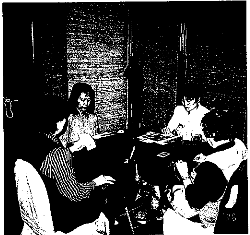
The Ladies' Matches.